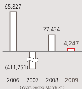
Net Income (Loss) (Millions of yen)